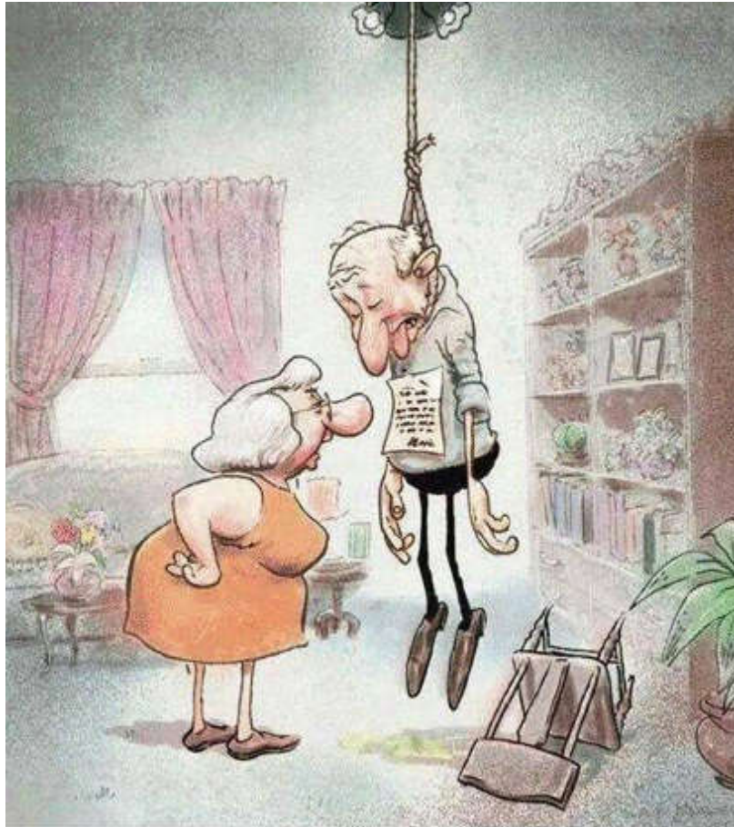
"You misspelled 'constant criticism'."