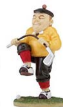
Rebel Tour Melbourne 2009